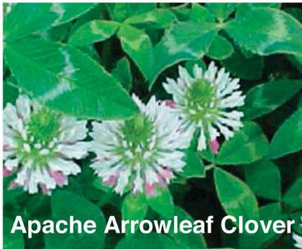
Apache Arrowleaf Clover

Better Grazing. Crown Rust Resistance. Excellent Winter Hardiness.